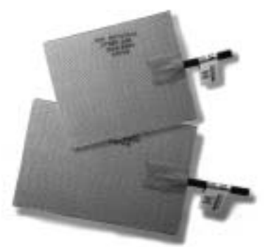
Not for use on batteries

CAUTION: Do not use pads with higher than recommended wattage for specific oil capacities.